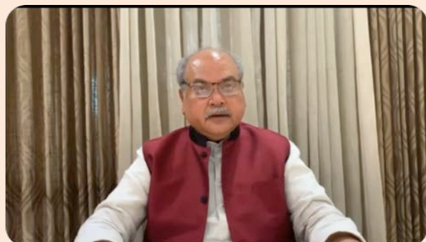
Chief Guest Shri. Narendra Singh Tomar, Hon'ble Minister of A&FW, Government of India addressing the event.