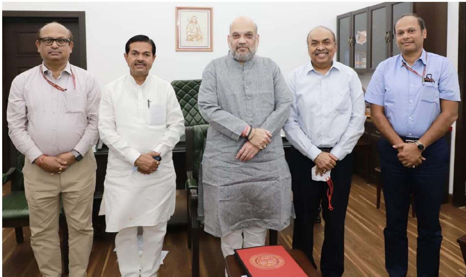
The first meeting of Ministry of Cooperation taken by the first Minister for Cooperation of India Shri Amit Shah Ji on 9 July 2021