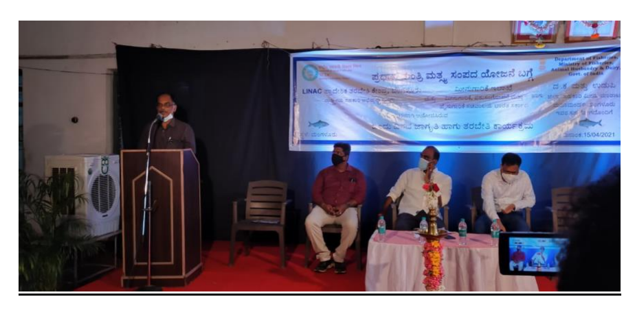
Welcome address by RD, NCDC

Officials/Board Directors of Primary Level Fishery cooperative, Officials of Fisheries Department, Costal Development Authority, Mangaluru and Directors/ officials of SK and Udupi District Fish Marketing Federation attended the programme.