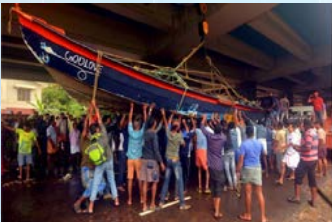
Integrated Fisheries Development Projects (IFDP).

The role of Matsyafed (Kerala State Cooperative Federation for Fisheries Development) in this respect is admirable. The success of the experimental operation with 2 fishing group, initiated by MD, Matsyafed and his team at Matsyafed played a pivotal role in transforming the scenario and reducing the casualties substantially. Later on, this mode of rescue operation was carried out in all affected places. Matsyafed set up Rescue operation cell – ROC, in all districts to monitor and support the crisis in respective districts when floods started. The vigilant team of the ROC and primary cooperative societies of matsyafed worked in unison and 557 fishing crafts comprising nearly 2600 fishermen members of affiliated primary cooperative societies were deployed in the evacuation process all over the affected area in the state. It is a matter of pride that matsyafed beneficiaries comprised about 74 % of the total fishermen in the rescue team. It was a befitting and overwhelming reciprocation to Matsyafed which acts as their benefactor extending support for their livelihood. This solidarity displayed in the face of adversity was one of its kinds collective coming together, unlike any other agencies. NCDC can also share a pride of having indirectly supporting rescue operations, as most of the boats used in the rescue operations were distributed under NCDC assisted