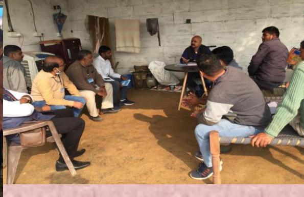
Study visit at Shrimp Farm, Sultanpur (Haryana)