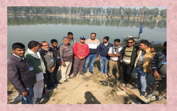
Study visit at Sumit Fish Farm, Charkhi Dadri (Haryana)

A one month long on campus training program was organized at LIFIC, Gurugram for 10 incubatees from 4 states namely- Maharashtra, Gujarat, Bihar and Himachal Pradesh. A study visit (during 4-6 Dec., 2021) to fisheries business farms was also organized for incubates. This training program primarily focused on converting entrepreneurial ideas into business models and then support the launch of business operations.