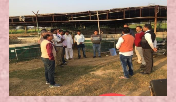
Study visit at Yadav Biofloc Farm, Hansi (Haryana)