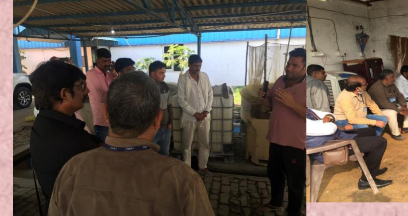
Study visit at Sultan Fish & Seed Farm, Karnal (Haryana)